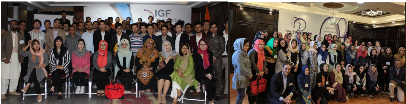
Pic: From IGFA 2018