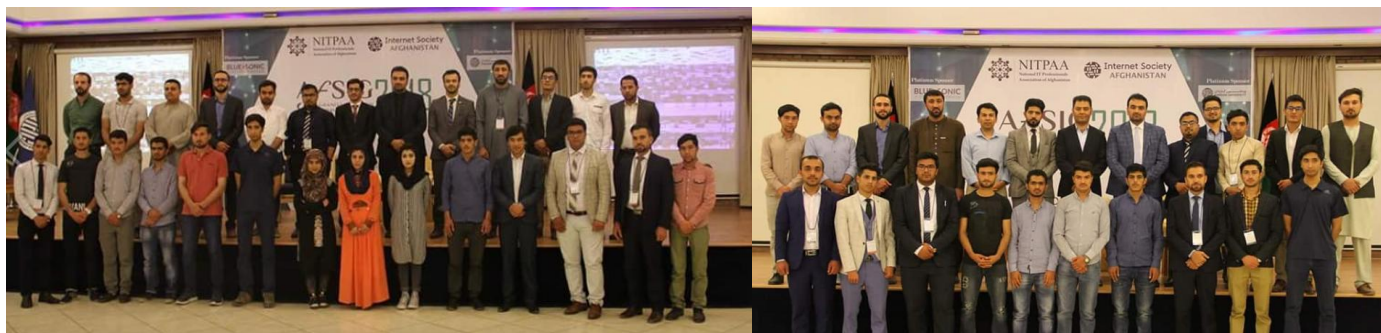
Pic: From AfSIG 2018